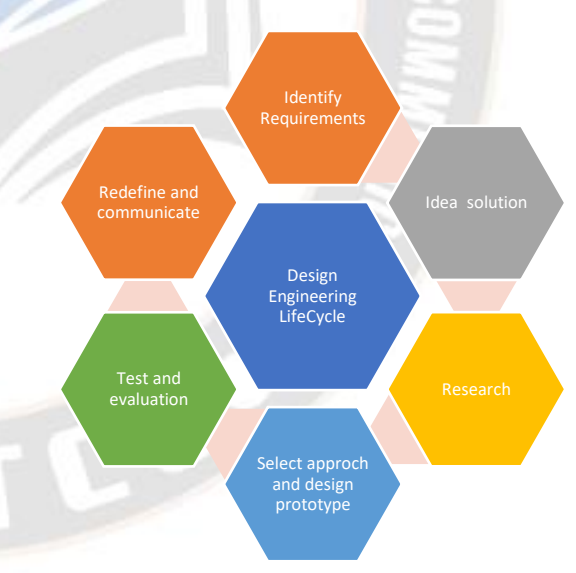
Figure 1. Design Engineering Stages.

Design Engineering Process stages: - [1]