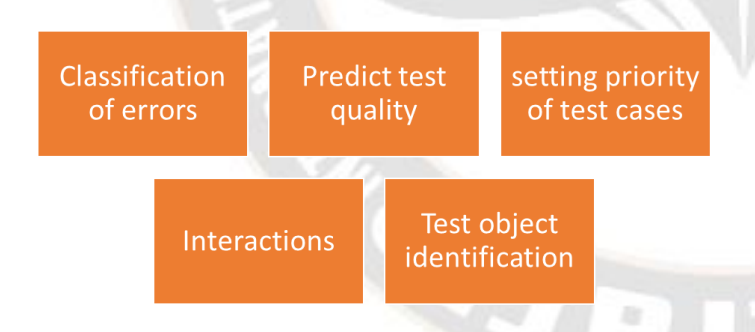
Figure 2 Use of AI in software testing

2. and 3. Artificial Intelligence and Machine Learning: - The use of artificial intelligence as well as machine learning have a great impact on the software testing of the services. They have not only improved the process of testing but has also helped to speed up the process of software testing. It has proved to be a boon in the field of software testing. It has been used for the following purposes: -