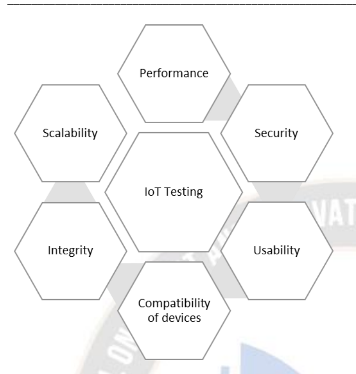
Figure 1 IoT testing

Article Received: 18 January 2020 Revised: 25 February 2020 Accepted: 10 March 2020 Publication: 31 March 2020