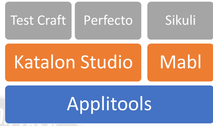
Figure 4 Tools used for Codeless automation Testing