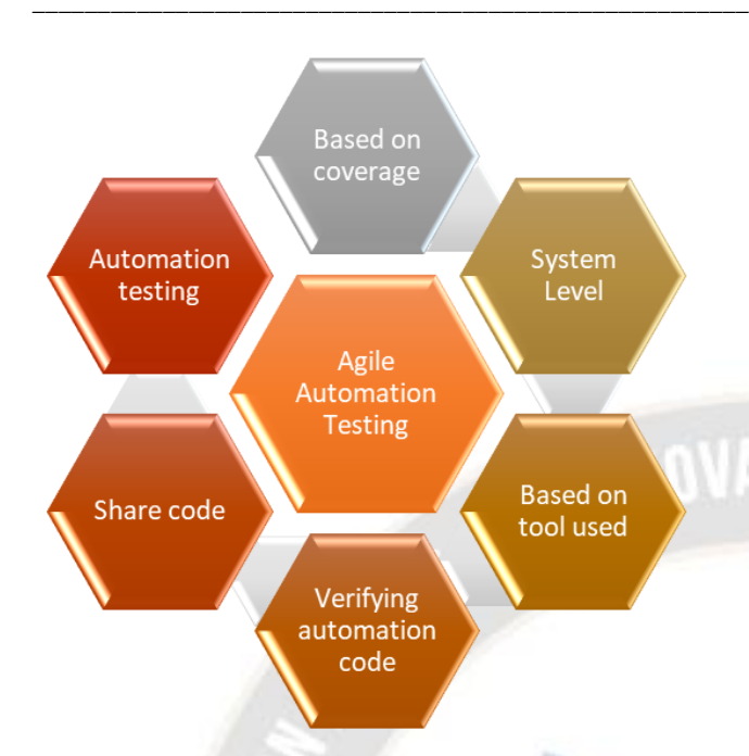
Figure 5 Agile Automation Testing

Article Received: 18 January 2020 Revised: 25 February 2020 Accepted: 10 March 2020 Publication: 31 March 2020