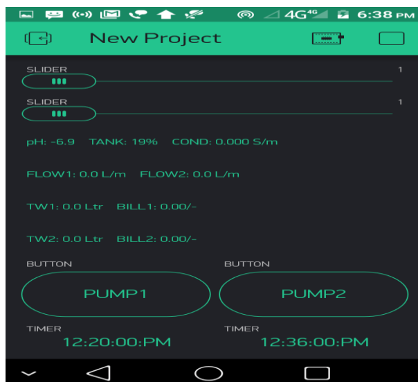
Figure 3.3 Output Window After Execution Of Level Sensor.

After addition of water in tank ultrasonic sensor senses the level of water. Here it shows that water tank is 19% fill. We can add more water in the tank. Ultrasonic sensor shows the level of tank fill by water.