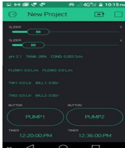
Figure 3.5 Blynk application shows the PH value

When the PH value is less than 6.5 then the flow sensor will not flow the water through the pump. This operation is done automatically. That means water will flow only when it has ideal range of PH value and it is safe to drink. It indicates alkalinity or acidity of a sample. PH value is measured in the scale of zero.