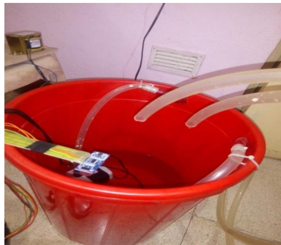
Figure 3.6 No water is flowing through the pipe

When the PH value is less than 6.5 then the flow sensor will not flow the water through the pump. This operation is done automatically. That means water will flow only when it has ideal range of PH value and it is safe to drink. It indicates alkalinity or acidity of a sample. PH value is measured in the scale of zero.