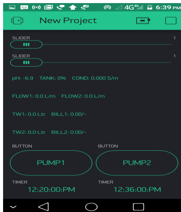
Figure 3.2 Output window before Execution of level sensor

Initially there is no water in tank so the reading of tank level is zero as soon as we start the water management system. The ultrasonic sensors detect the depth of water in the tank and gives signal to the microcontroller and we get different level reading Depending on water level on IoT platform window.