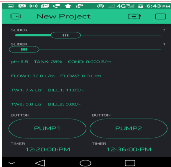
Fig 3.7 PH value of mineral water