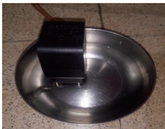
Figure 3.11 Measurement of Conductivity Sensor

Electrical conductivity is also an indicator of water quality. It measures free chlorine without sample pretreatment. It does not have messy and expensive reagents needed. Conductivity data can detect contaminants, determine the concentration of solutions and determine the purity of water. It is Compact in size. Conductivity sensor measures conductivity by AC voltage applied to nickel electrodes. These electrodes are placed in a water sample and reading is obtained.