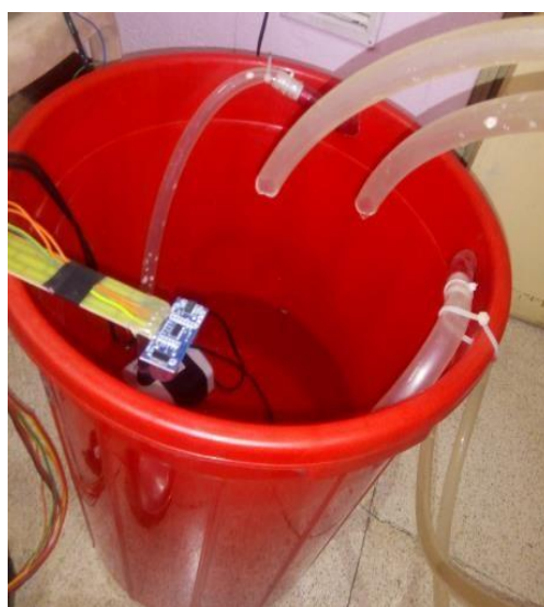
Figure 3.10 No water flow through pipe\

Here PH value shows value 8.6. This water has no drinking quality. So here also no water will flow through pipe. Higher PH Value indicates that bad quality of water. If we press pump 1 button then no water will flow through the pipe. This is same for pump 2.