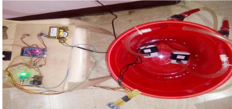
Figure 3.1 Hardware of IOT based water management system

When the supply is given to the system this signal is fed to the Arduino Microcontroller then Microcontroller process the signal and produced a desired output (Performs control action). This desired output is also transmitted by Wi-Fi transceiver at controller side. The current status of Bin is displayed on IoT window. The required time for the complete process is few minutes.