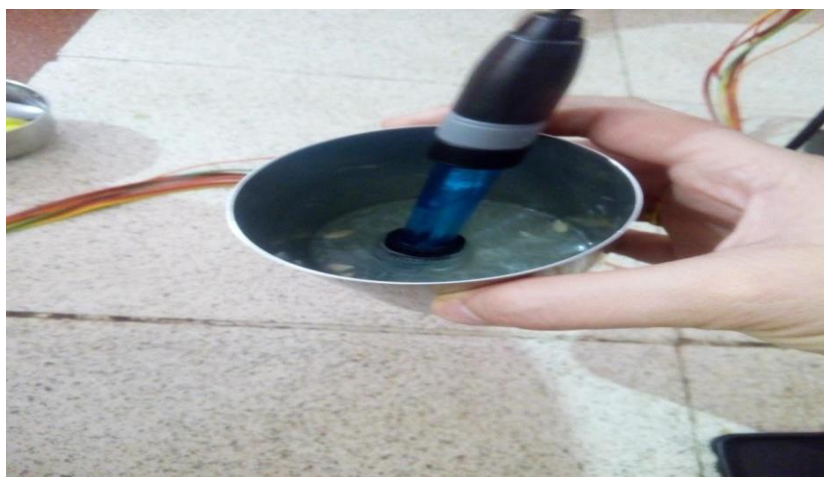
Figure 3.4 PH sensor dip into lemon juice

Lemon juice have PH value 2. When the ph sensor is dip in to lemon juice it shows the value on the blynk application.