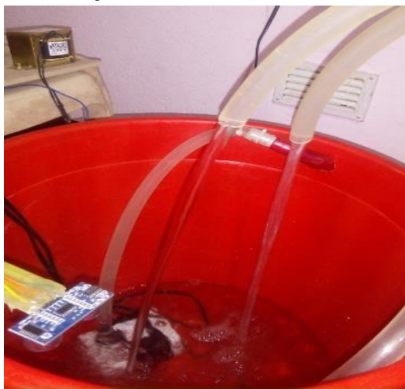
Fig. 3.8 Water flow through pipe

Here PH value show 6.5. This water is safe to drink, when water has safe PH range then only water will flow through pipe. When we press pump 1 button then through pump 1 water will flow. This procedure is same for pump 2. We can press both the pump at a time. Both the pipe is flowing water.