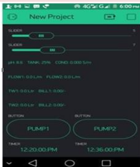
Figure 3.9 PH value above 7.5