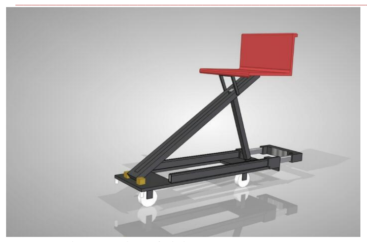
Figure 3: View of Sitting Arrangemnet.