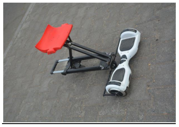
Figure 5: Original Picture of Segwalk 11.