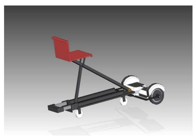
Figure 4: Side Viewof Segwalk 11.