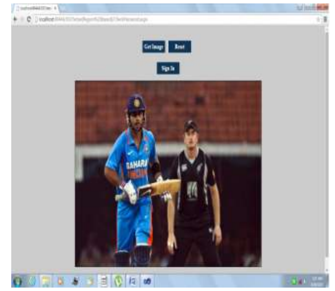
Figure 4 : Screenshot of Sign In Page

After clicking on generate password at the time of sign in this window will be generated, then click on the get Image and the select accurate region for the password which can be selected at the time of registration. After selecting an