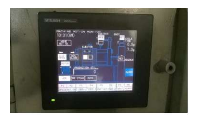
Fig.3: Front Panel Monitor Of GOT1000