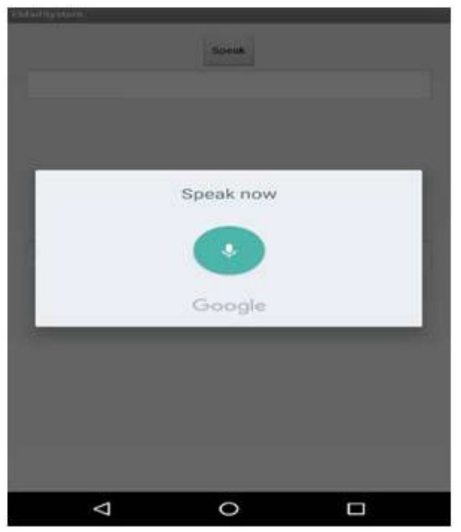
Figure : Mobile Application

Whenever the system asks for any input from the user, the user just needs to click on the speak button shown in the above screenshot. When the user clicks on the speak button a Google speech to text service gets opened as shown in the screen shot below and the user gives the required details and the user gives the input in the form of voice then the speech to text conversion takes place. As shown in above figure user have to speak through android mobile phone using the application. When the user clicks on the speak button the Google speech to text popup gets displayed and then the user