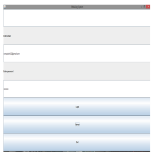
Fig . Inbox

This option helps the user view all the mails that has been received to their account. The user can listen to mails they wants to by performing the click operation specified by the prompt. In order to navigate through different mails prompt will specify which operations to perform. Each time the mail is selected the user will be prompted as whom the sender is and what is the subject of that particular mail. The system will read the complete mail along with email id