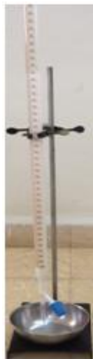
Fig.2 Experimental Set up

when the milk drop crosses the upper(top) mark. The stopwatch is stopped when milk drop crosses the bottom(lower) mark. Time 't' taken for the drop to move the distance 'd' between the top and bottom marking is noted. Number of trial is made and then terminal velocity is calculated using equation V=d / t .