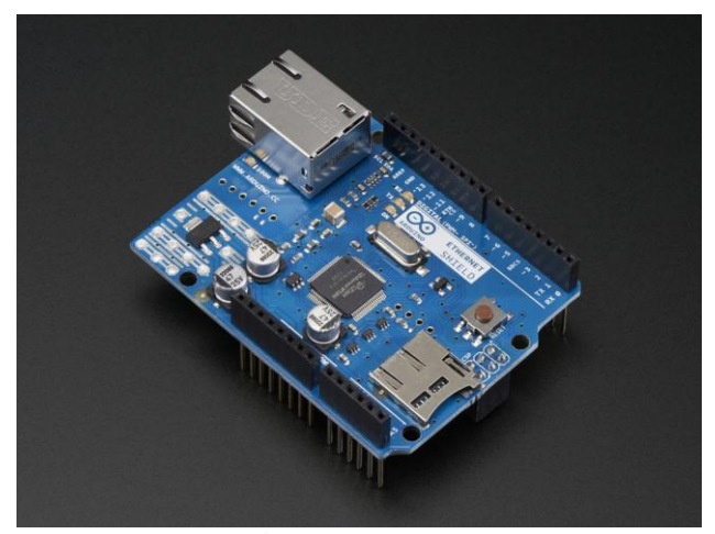
Fig (2): Ethernet Shield

The figure (fig.2) shown below is an Arduino Ethernet Shield .It connects Arduino board to internet. It is based on Wiznet W5100 Ethernet chip for communication. This provides internet stack capable of both TCP and UDP. The Ethernet shield has micro SD connector. The Arduino board pins 10,11,12,13 are used to communicate with Ethernet shield, so they cannot be used for general I/O.