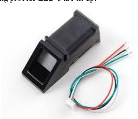
Fig (3): Fingerprint Scanner

It performs functions like fingerprint scanning, image processing, fingerprint matching, searching and template storage. For image rendering, calculation, searching high powered DSP chip is used. This module is connected to any microcontroller with TTL serial and send packets, detect thumb prints, and search. During scanning process LED's are lit up.