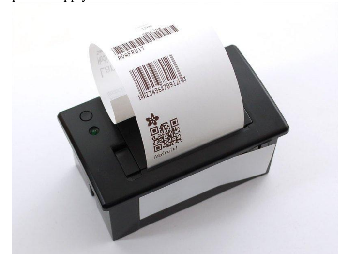
Fig (4): Thermal Printer