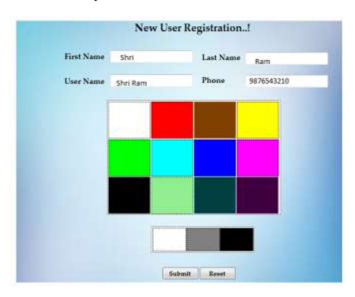
Fig. 1 User Registration

The user needed input at the time of registration is encrypted using the ECC algorithm and is stored in a file. For every user's encryption is done with different keys. Different keys are maintained in a separate database file. In case of encrypted file is compromised, the information stored by the users is not exposed. The major role of this proposed scheme is to form the nine characters along with special character one time password with these combinations.