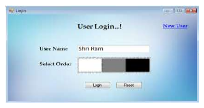
Fig. 2 Authentication process step 1