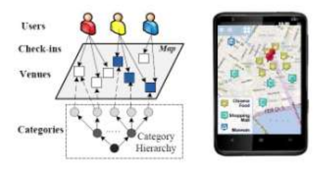
Fig.1 Diagram of various users check-ins venues in various mapping location.

The user based top-N recommendation algorithm uses a similarity based vector model to identify the k most similar users to an active user. After the k most similar users are found, their corresponding user item matrices are aggregated to identify the set of items to be recommended. A popular method to find the similar users is the Locality sensitive hashing, which implements the nearest neighbor mechanism in linear time. The advantages with this approach include: the explain ability of the results, which is an important aspect of recommendation systems; easy creation and use; easy facilitation of new data; contentindependence of the items being recommended; good scaling with curateditems. There are also several disadvantages with this approach. Its performance decreases when data gets sparse, which occurs frequently with web related items. This hinders the scalability of this approach and creates problems with large datasets. Although it can efficiently handle new users because it relies on a data structure, adding new items becomes more complicated since that representation usually relies on a specific vector space. The recommender system compares the collected data to similar and dissimilar data collected from others and calculates a list of recommended items for the user. Several commercial and noncommercial examples are listed in the article on collaborative filtering systems.