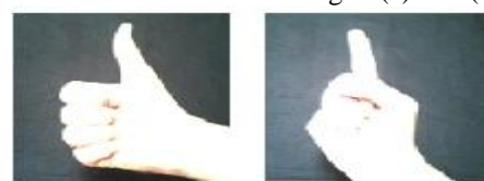
Figure 3. (a) and (b) various gestures to represent number one

The recognition of gesture depends purely on the number of raised fingers. So any finger can be used to denote a count. Only the count value of the raised fingers is taken as input. Here, the user can feel free to represent a count irrespective of the finger. Hence, value one denoted using the thumb or index finger will be the same as shown in Fig. 3 (a) and (b).