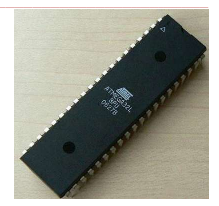
Figure 2 : Micro-controller: AVR At mega32

The high-performance, low-power Microchip 8-bit AVR RISC based micro-controller combines 32KB ISP flash memory with read-while-write capabilities. AVR was one of the first micro-controller families to use on-chipflash memoryfor program storage, as opposed to one time programmable ROM used by other micro-controllers at the time.