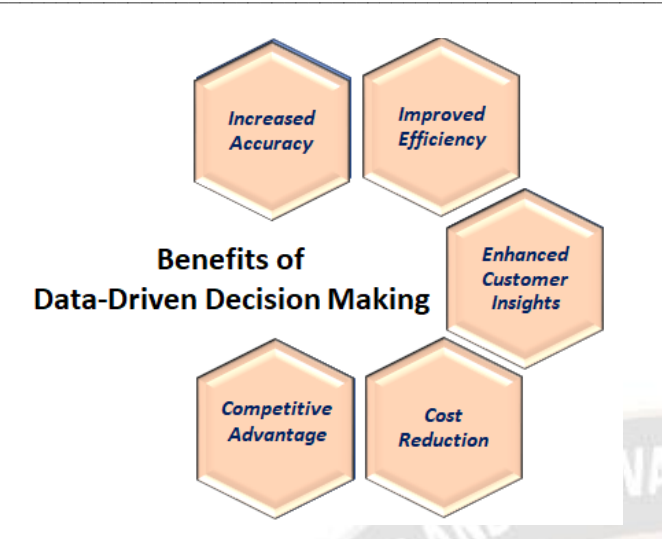
Figure 3. Benefits of Data Driven Decision Making