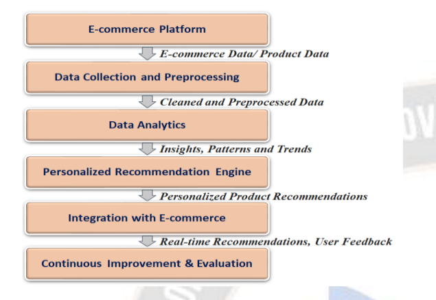
Figure 4. Architecture

The architecture is illustrated in the following figure 4.