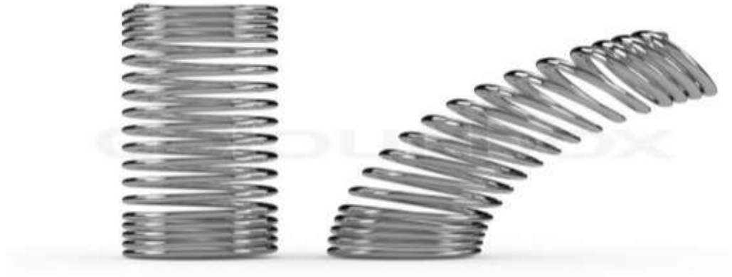
Fig.5.1.1 Coil spring

Spring is elastic object used to store mechanical energy. Springs are usually made out of spring steel. There are large number of spring designs; in everyday usage the term obtain refers to coil springs. Small spring can be wound from prehardened stock, will larger ones are made from annealed steel and hardened after fabrication. When coil spring is compressed or stretched slightly from rest, from the force it exert is approximately proportional to its change in length. Depending on the design and required operating environment, any material can be used to construct a spring, so long as material has the required combination of rigidity and elasticity.