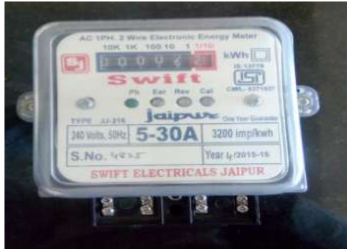
Fig . 4 Energy meter

These natural resources filled in water for some specific time and take reading after some specific time and take reading of energy meter.