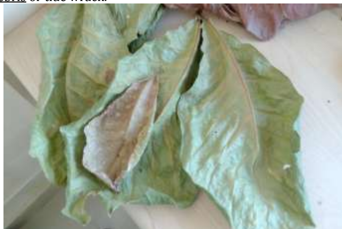
Fig. 3 Almond Leaves

Driftwood is wood that has been washed onto a shore or beach of a sea, lake, or river by the action of winds, tides or waves. It is a form of marine debris or tide wrack.