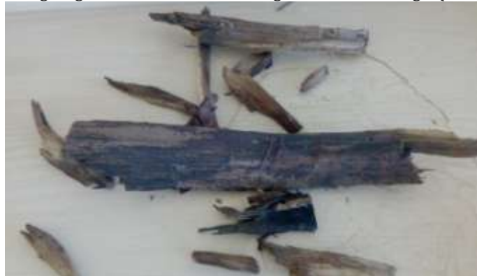
Fig 2. Driftwood

Sphagnum is a genus of approximately 380 accepted species of mosses , commonly known as peat moss. Peat moss store water capacity is good. Living and dead cells large quantity consisting it. Due to that plant height increases very well in manner. (Bold,1967) The empty cells help retain water in drier conditions. Hence, as sphagnum moss grows, it can slowly spread into drier conditions, forming larger mires , both raised bogs and blanket bogs . (Gorham, 1957).