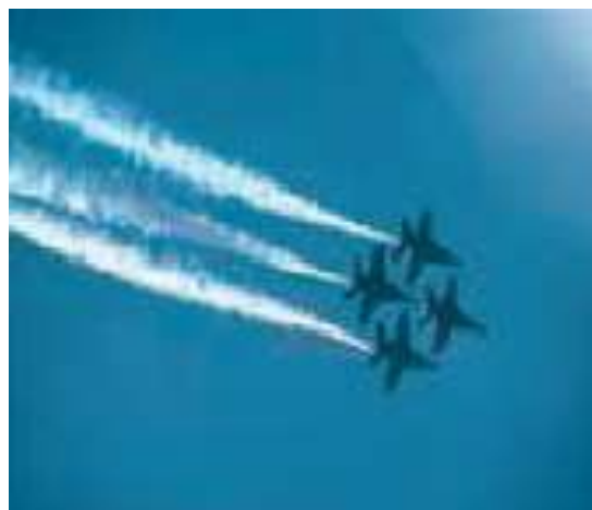
Fig. 1: Simple Image [1].

Annotation is nothing but estimation note or text. Image annotation is a process in which human provide a key in form of words (text) to the system, then system find out those images, words that express the image? i.e. Sky, Jets, Smoke.