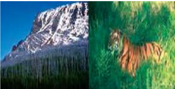
Fig. 3: Fault in Image Retrieval [1].

Some image search engines are stood on a keyword or tag equivalent. Label based image retrieval (TBIR) process is one of the image retrieval techniques, which are not only professional but also effective in the image annotation task [2].