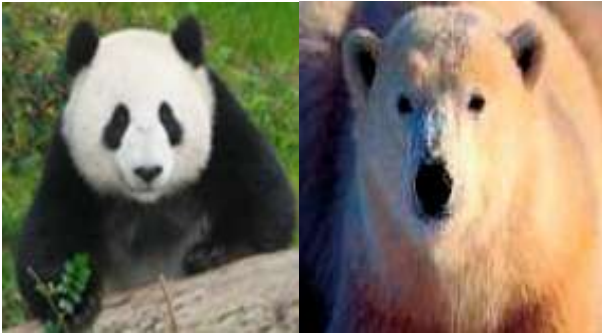
Fig. 2: Correct Image Retrieval [1].