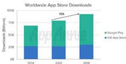
Fig. 1 Worldwide App Store Downloads

Reduced mobile internet charges, ease of use, ubiquitous working, technology advancement of smart phones and transformation of mobile device into mobile wallets made tremendous increase in mobile subscribers and mobile commerce businesses. People can search and compare different product, get live NEWS, do payment, buy products anytime anywhere using mobile internet, mobile Apps which are made available by the corresponding companies and therefore there is tremendous growth in mobile commerce business. Fig1. shows Worldwide App Store downloads for different mobile applications. Downloads, earnings, and time spent in Apps all grew by double digits during 2016, according to a report by market researcher App Annie. Time spent in Apps grew more than 20 per cent to nearly 900 billion hours in 2016, according to the year-end report. During the year, India surpassed the U.S. as the No. 1 country by Google Play downloads. India grew from more than 3.5 billion downloads in 2015 to more than 6 billion last year. The country's smart phone penetration stands at only 30 per cent, so there is a great chance for more growth [6]. Mobile commerce involves not only Mobile Payments but also content purchase and delivery, location based services, Information services, mobile marketing and advertising as described below.