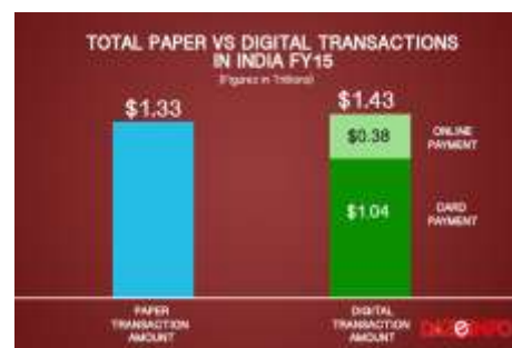
Fig. 2 Total Paper Vs. Digital Transactions in India FY 2015

is expected to reach 100 million customers using mobile wallet in the country during the next 5 years as smart phone users in India will grow with time using better connectivity option. During these online transactions 50000 GB data is generated per second. Consider a customer using Mobile App for shopping. New customers have to register the App. The customer writes user name and password. OTP is generated and sent to the customer through SMS for user and device authentication. The customer submits the OTP and do successful login. In this login process, data such as user name, password, OTP, mobile number, process ID, time of login, request time for login and response time of the server for successful login, number of attempts to login, is generated. After successful login user search products, add products to the cart and wish list, remove items from cart. In this process data such as user name, products searched, the search criteria such as discount, brands, colors, product size, delivery time is generated. Customer proceeds for checkout. In Checkout process data such as number of products, total amount, shipping address, mode of payment such as cash on delivery, credit/debit cards, net banking, mobile wallets, card details such as card number, type of card such as VISA PLATINUM, Maestro, RuPay, name on card, CVV, Expiry date, amount to be paid, OTP for transaction, transaction ID is generated.