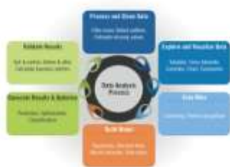
Fig. 4 Data Analysis Process

There must be a wide range of models that provide different perspectives of the data. Decision trees, Naïve Bayes classifier, neural networks, ARIMA, regressions, SVM, and discriminant analysis are some models. It is very important to understand the advantages and limitations of every algorithm. It is very important to document the assumptions and results clearly. The purpose of this big data analysis process is to produce information and results that lead to valuable business decisions which should match the initial business objective.