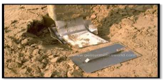
Fig.4.2.1Insertion Of PVD