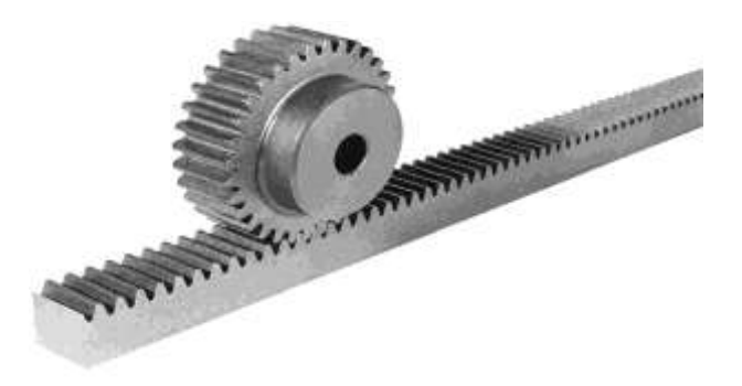
Fig-1: Rack and Pinion

A cylindrical bar of diameter equal to the rack diameter is drawn in ADAMS using 'Cylinder' option in ADAMS. The rack cutter is plunged into the blank by amount 'x', as shown in Figure 9(a), to achieve a flat top land for the teeth cut on circular bar. Two markers defined in the workspace of the model to represent the global coordinates and the local coordinates of the rack, as in Figure 8(c). In the prototype, the global and local coordinate markers represent the normal and transverse pitches of the gears respectively. The cutter rack is oriented in relation to the blank according to the helix angle of the rack. With the use of the option 'Cut out solid with another' from the Boolean geometry of the ADAMS toolbox, the cutter rack geometry is subtracted from the rack bar. The resulting body is the rack of the RPS gear (Figure 9(b)). The face-width of the rack teeth varies from top to the bottom of the teeth due to the circular cross section of the rack bar. It has minimum face-width at the top of the teeth, which gradually rises to maximum at the bottom of the teeth. Modelling of rack (a) the rack bar and the basic rack cutter rack bar with helical teeth.