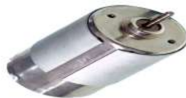
Fig 4. Motor

Traditional DC engines utilize a stationary magnet with a pivoting armature consolidating the replacement sections and brushes to give programmed substitution. In examination, the brushless DC engine is a turned around plan: the changeless magnet is pivoting though the windings are a piece of the stator and can be empowered without requiring a commutator-and-brush framework.